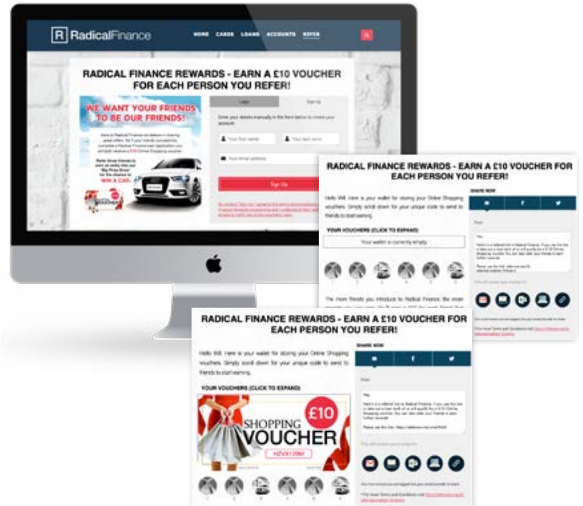
An illustration for how a campaign might look for a financial service brand.

Using powerful interactive reporting, you can then track which individuals, rewards and channels are generating the most referrals to enable ongoing optimisation and further segmentation of future campaigns.